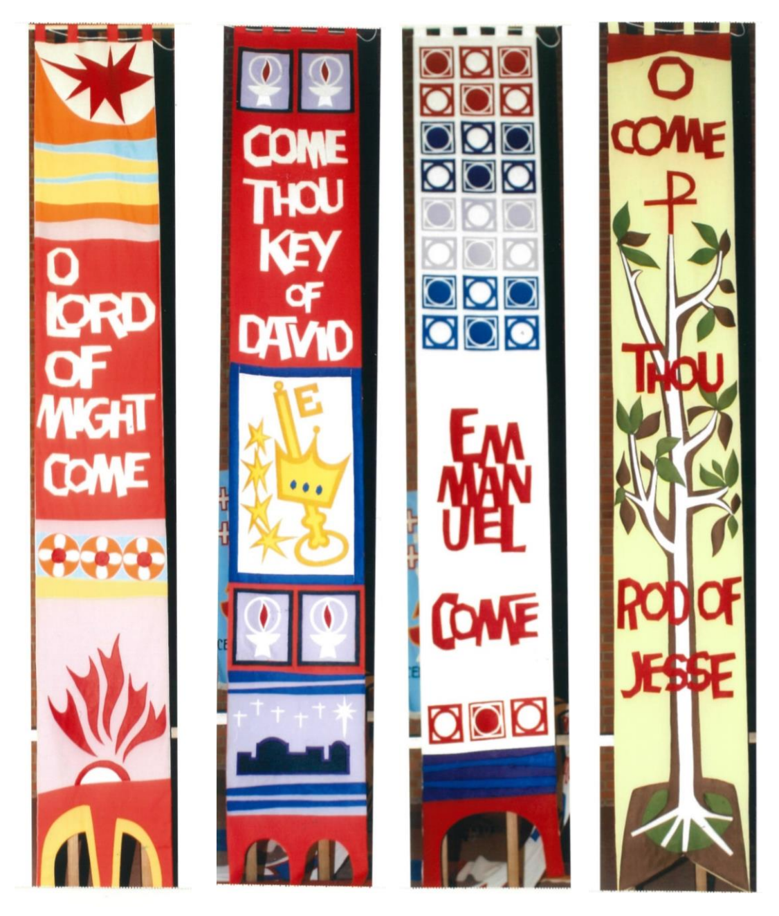
The one who testifies to these things says, 'Surely I am coming soon.' Amen. Come, Lord Jesus! Revelation 22:20