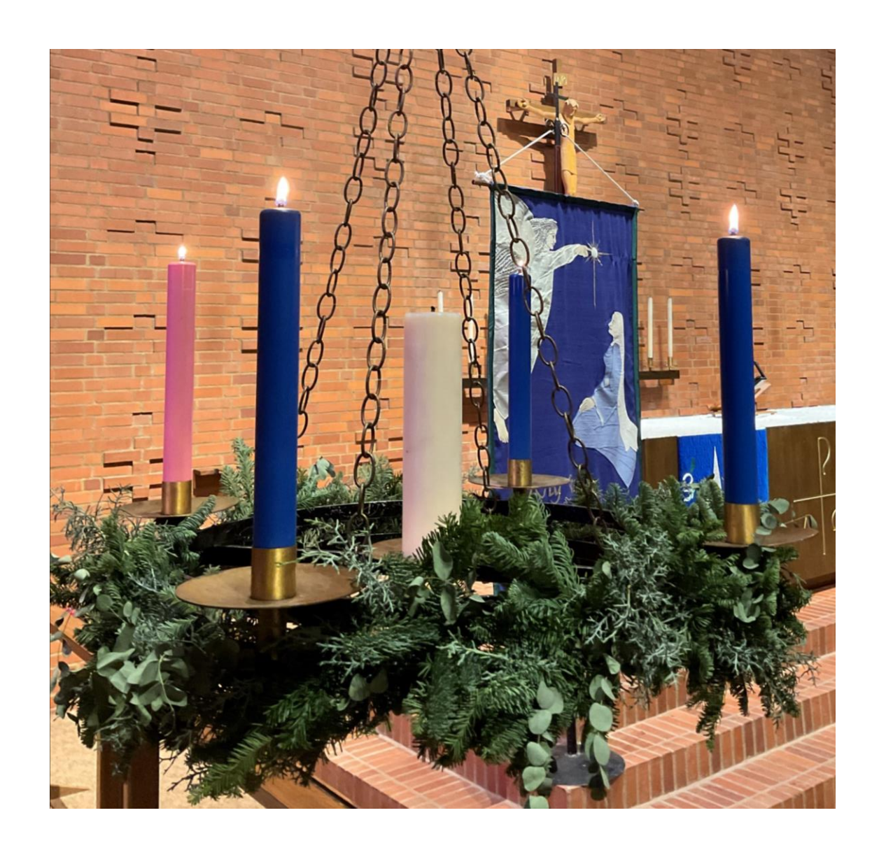
And now faith, hope, and love abide, these three; and the greatest of these is love. 1 Corinthians 13:13